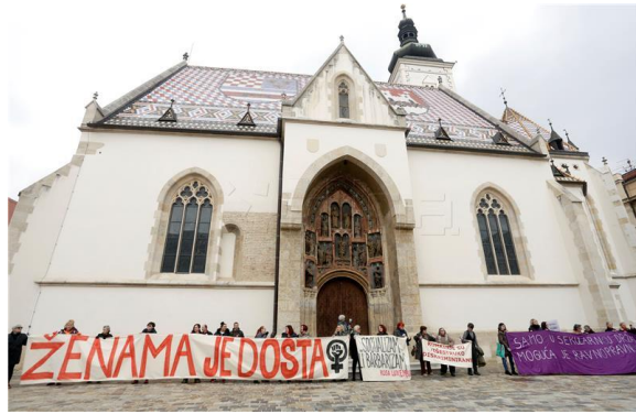
General Assembly of Women's Network Croatia in Zagreb