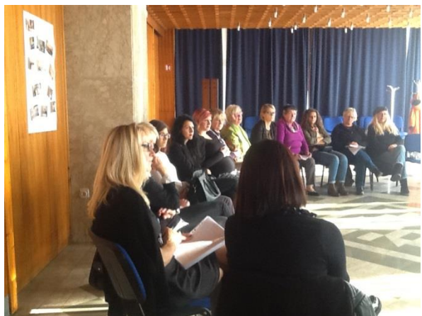
From 29 April – 1 May 2016 with Mediteranian Women's Fund we suorganized the third Croatian women's organizations strategic reflection meeting in Zagreb, Hotel Dubrovnik, with 22 activist from